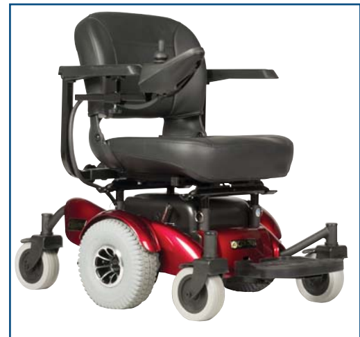
Optional black vinyl stadium seat shown